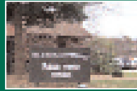
Public Works office open for business. ~ page 2