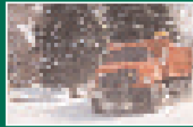
New ordinance clears the way for ice and snow free roads. ~ page 2