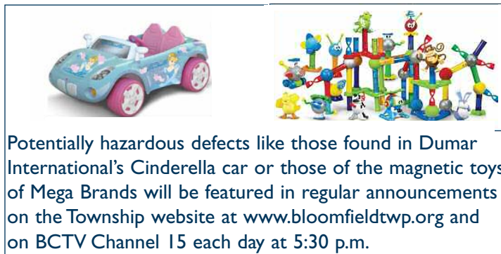
Potentially hazardous defects like those found in Dumar International's Cinderella car or those of the magnetic toys of Mega Brands will be featured in regular announcements on the Township website at www.bloomfieldtwp.org and on BCTV Channel 15 each day at 5:30 p.m.

The information can also be found on the Township's website at www.bloomfieldtwp.org under the "Fire Services" page. There, visitors can click on the new feature titled "Recalls" to view information regarding products under recall and potential remedies.