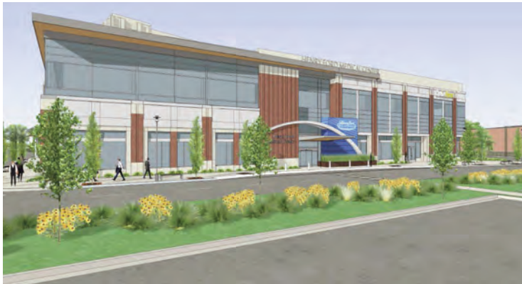
The Henry Ford medical center will be a key component of the Village at Bloomfield.

That should bring an end to one of the most convoluted, wrenching development stories