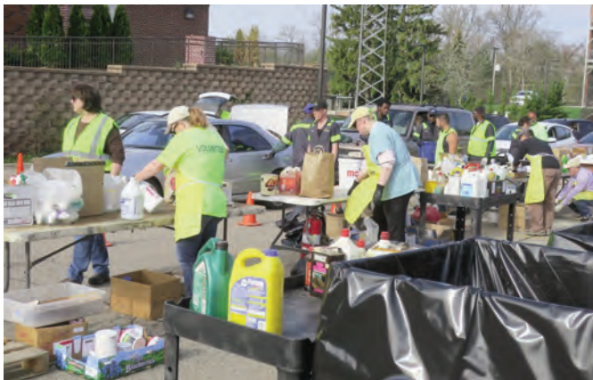
More than 900 cars came by to drop off items at the Household Hazardous Waste Drop-Off Day.

In April the Township hosted the Electronic Recycling, Medication Disposal and Paper Shredding event. As usual, it was a huge success. More than 1,230 cars pulled onto the Township campus to drop off the material for