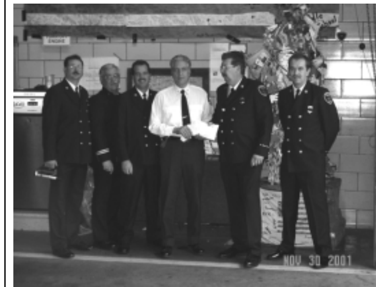
Bloomfield Township firefighters present their check to Battalion Chief #9 in Manhattan.