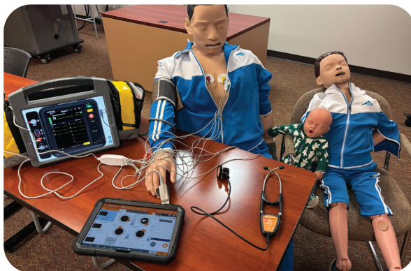
A simulated test using the new REALiTi 360 Plus Simulated Patient Monitor on realistic patient mannequins.

The goal of the simulator is to improve the preparedness, confidence, and competence of EMS personnel in handling critical incidents. It addresses key risks such as improper patient assessment, delayed treatment, and poor communication during high-stakes situations. By simulating these challenges, this tool helps reduce errors and improve patient outcomes in the field. The REALiTi 360 Plus SPM has been making a difference in EMS training for over six months.