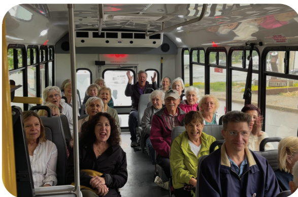
A group heading out on one of the over seventy day trips offered by Senior Services.