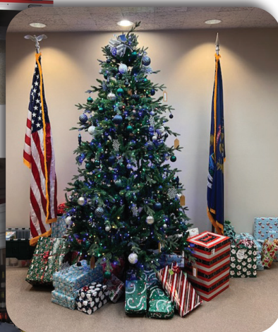
Presents for a local veteran's family underneath the Giving Tree at Township Hall.