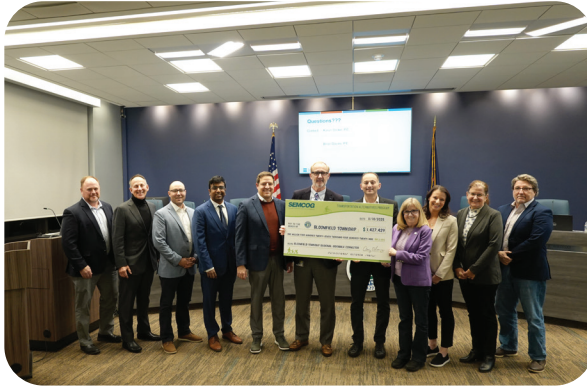
SEMCOG and State Representatives present a check to Township Engineering Director and Township Trustees for $1,427,429 to help fund a 1.4-mile pedestrian safety path.

The Southeastern Michigan Council of Governments has awarded $1,427,429 in Transportation Alternatives Program funding for a 1.4-mile safety path between Telegraph Road between Golf Drive and Mail Drive. SEMCOG awarded a ceremonial check at the November 11, 2025 Board of Trustees meeting.