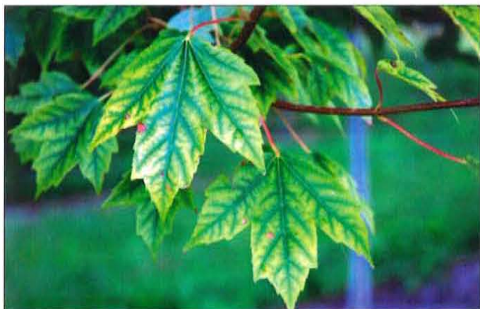
Interveinal chlorosis of red maples often indicates a manganese deficiency

Some responses of trees and shrubs to fertilization may occur fairly rapidly. Trees that are deficient in nitrogen, for example, may show improved leaf color within a few weeks of fertilization. Other responses, such as reducing pH to correct iron or manganese deficiencies, may require a full season or longer to show a response. Follow-up soil tests and re-application may be needed.