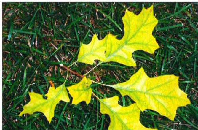
Interveinal chlorosis of pin oaks often indicates an iron deficiency