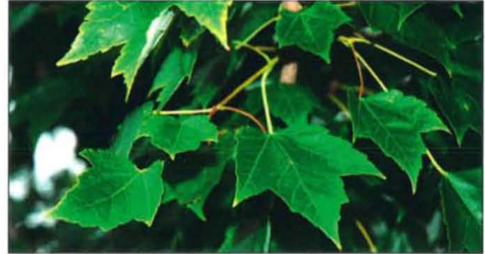
Proper nutrition is needed for optimal plant growth and color

reduced nutrient availability associated with other factors, often high soil pH. Nutrient elements that are needed in the largest quantities are termed macronutrients. Micronutrients, in contrast, are elements needed in very small or trace amounts. When analytical laboratories run a foliar analysis to determine the chemical composition of leaves, macronutrients are usually expressed as a percent (%) of leaf dry weight, whereas micronutrients are expressed in parts per million (ppm).